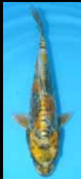
Doitsu Kin Showa