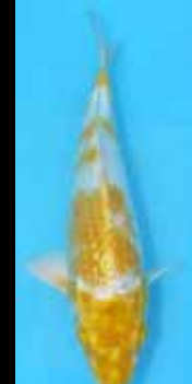
Gin Rin Hariwake